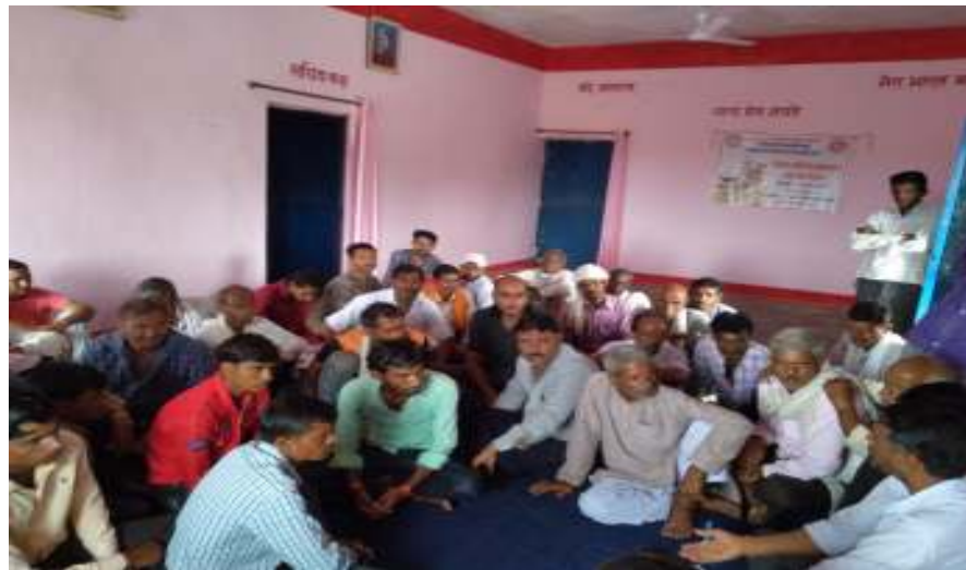
Gram Sabha Meeting in Mahendra Maheba GP