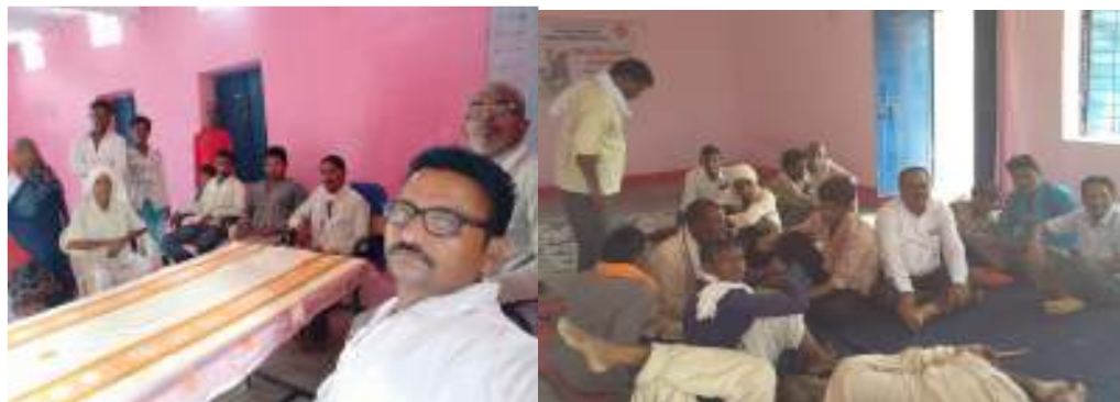
(GP Prempura and GP Gona)